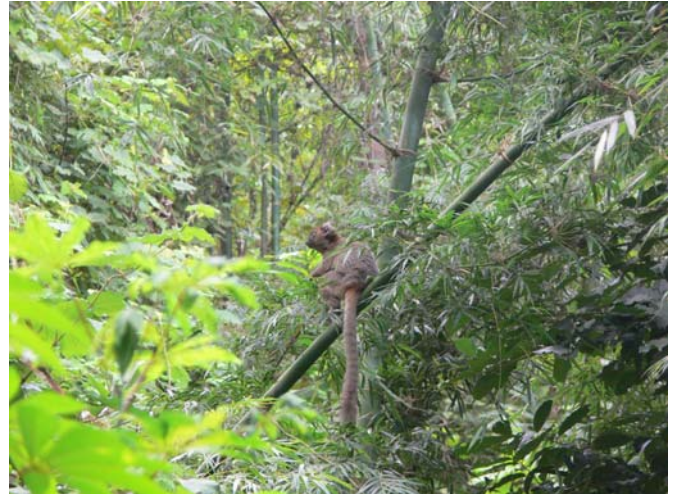
Figure 5. A greater bamboo lemur in a stand of the endemic bamboo Valiha diffusa surrounding the Andriantantely lowland rainforest, October 2011.