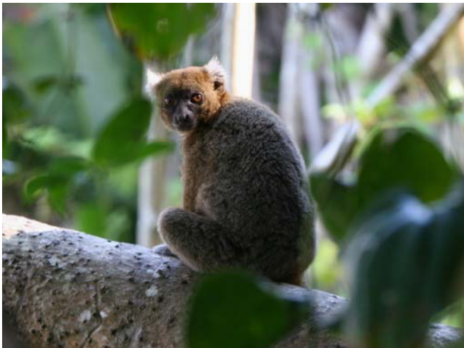
Figure 6. A greater bamboo lemur at the isolated lowland site of Sahavola, December 2011.