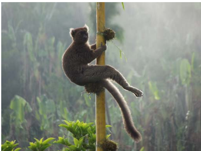
Figure 1. A Critically Endangered greater bamboo lemur Prolemur simus enjoying the early morning light at the isolated lowland site of Vohiposa, March 2012.

The greater bamboo lemur is endemic to Madagascar, and whilst fossil records show it was once widely distributed across the island, it is now restricted to a patchy distribution within the remaining eastern rainforest belt, and a handful of outlying degraded habitat fragments. A paper by Wright et al. (2008) highlighted the crisis of the greater bamboo lemur, showing that in 2007 only 60 individuals were known in the wild. To compound the situation, only 22 were known in captivity, in seven institutions, and almost all captive individuals outside Madagascar are descendants of just two wild-born founders.