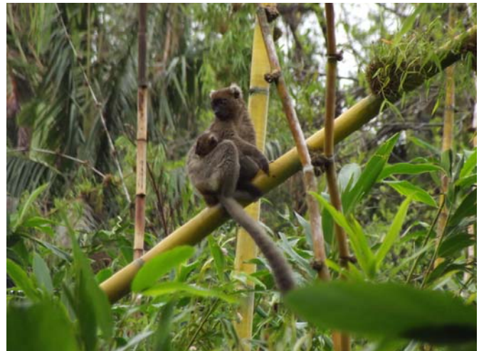
Figure 7. A greater bamboo lemur and baby at the isolated lowland site of Vohiposa, March 2012.