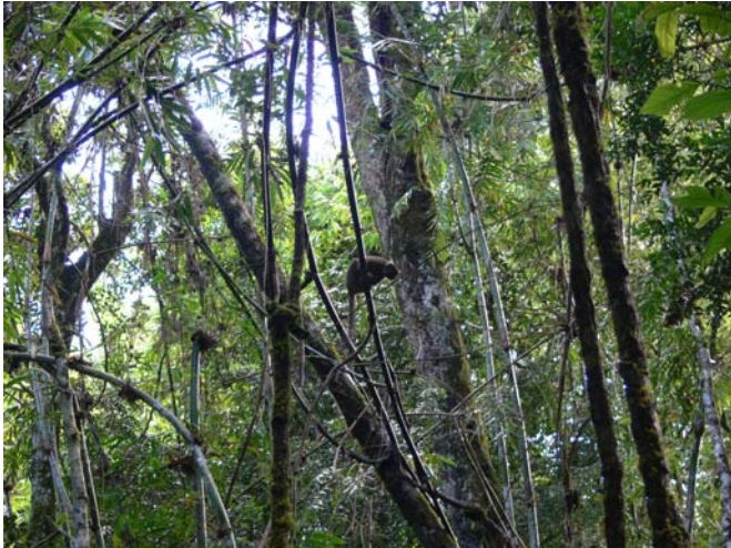
Figure 4. A greater bamboo lemur in a stand of giant bamboo Cathariostachys madagascariensis at the high-altitude Ranomainty community-managed site in the Ankeniheny-Zahamena rainforest corridor, January 2012.