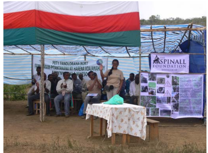
Figure 9. The inauguration ceremony for the signing of the management transfer agreement for the Ranomainty greater bamboo lemur site in the Ankeniheny-Zahamena rainforest corridor, November 2012.

Inside the CAZ corridor (Fig. 3), we facilitated the creation of the Ala maitso COBA for the Ranomainty site in the Didy Commune, resulting in the signing of their management transfer contract in Nov 2012 (Fig. 9), and facilitated the renewal of the